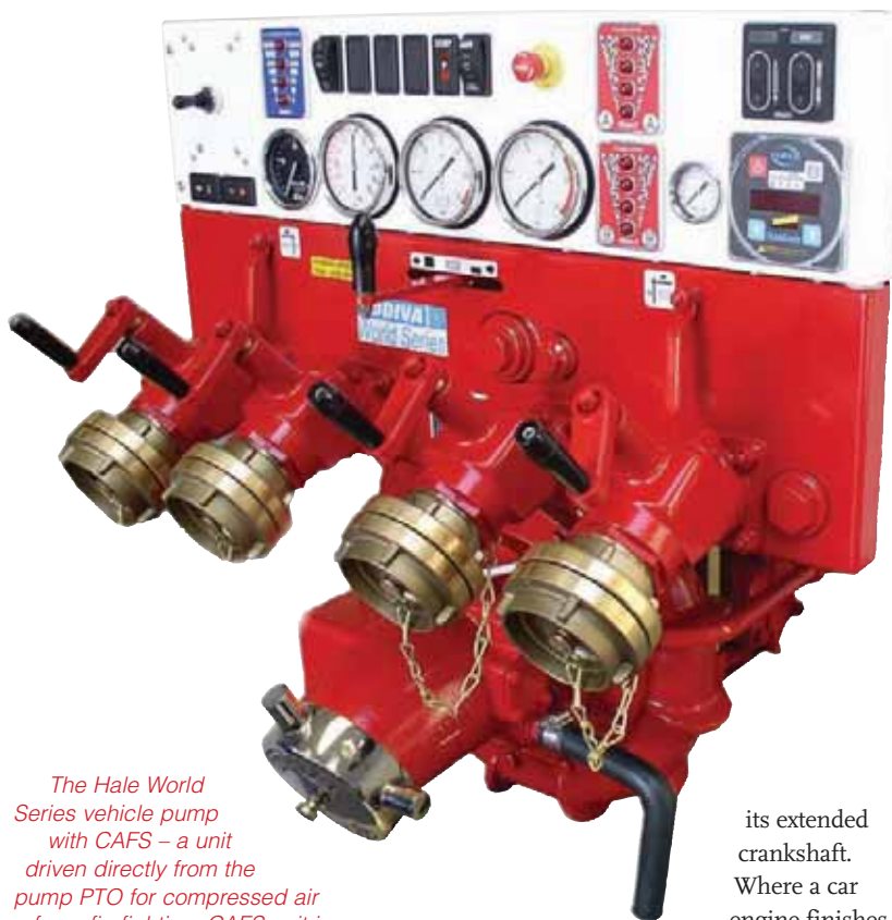
The Hale World Series vehicle pump with CAFS – a unit driven directly from the pump PTO for compressed air foam firefighting. CAFS unit is a compact package (attached to pump rear) comprising a compressor, FoamLogix proportioning unit and a mixing manifold.

An additional benefit of an industrial engine is